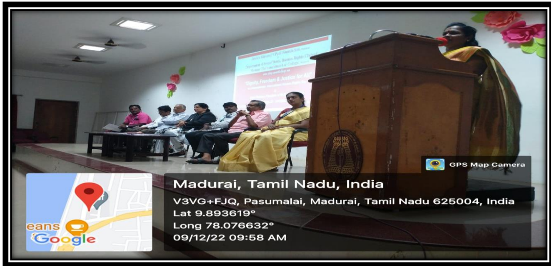
Welcome Address delivered by Club Convener